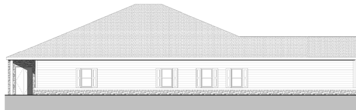
LEFT ELEVATION NOT TO SCALE