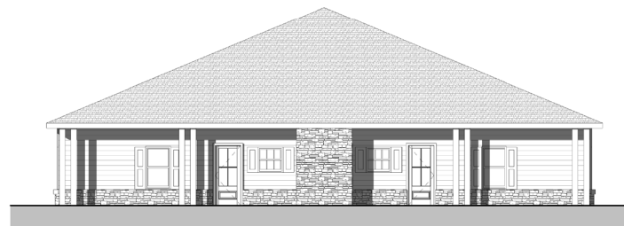
BACK ELEVATION NOT TO SCALE